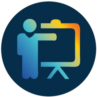
Learning & development